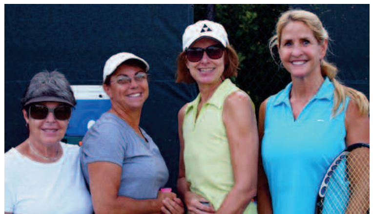
Wednesday Womens Group

They not only bring a high level of competition, but we appreciate the positive energy they bring to the morning. Always supportive of new players and current students they reflect the best of BCC.