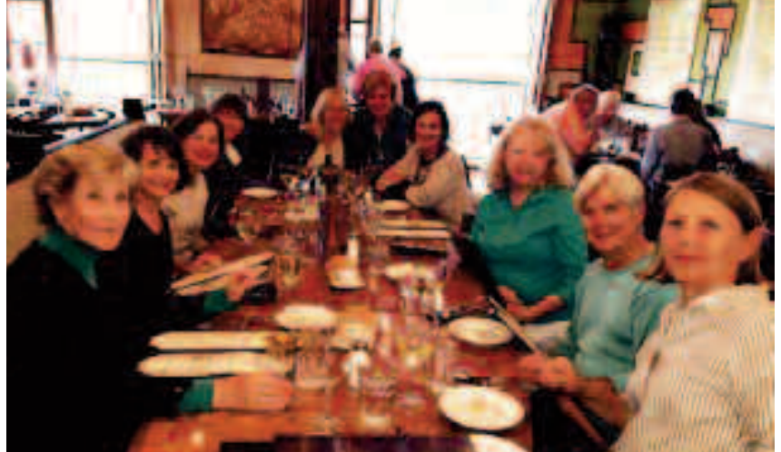
Dinner after playing at Wildcat Cliffs